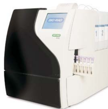
BioRad D-10 HB Chromatography System