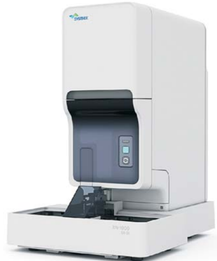
Sysmex XN 1000 Automated Hematology Analyzer