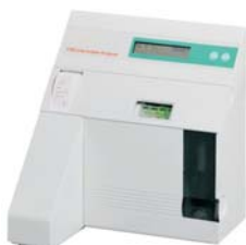
AVL 9180 Electrolyte Analyzer