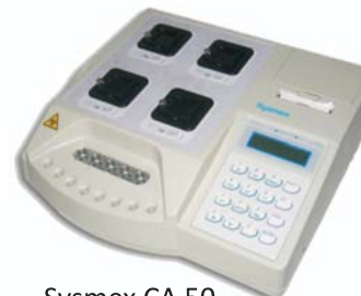
Sysmex CA 50 Coagulation System