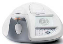
BTS 350 Chemistry Analyzer