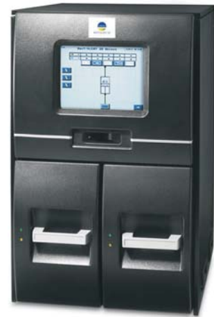
BacT ALERT Microbial Growth Detection System