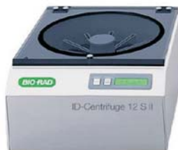
BioRad ID Centrifuge