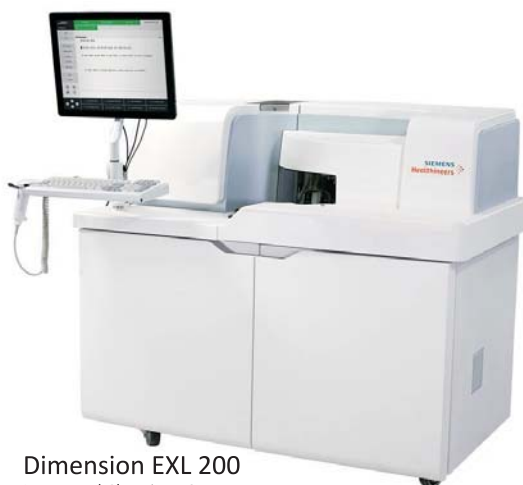
Dimension EXL 200 Integrated Chemistry System