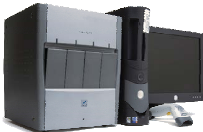
GeneXpert State of Art CBNAAT System