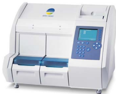
Mini Vidas Immunoassay System