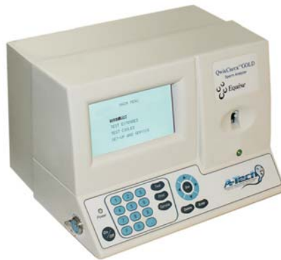
Qwik Check Gold Sperm/ Semen Quality Analyzer