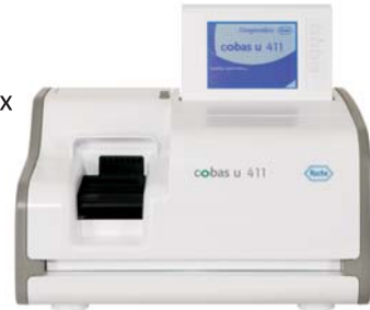
Cobas u 411 Automated Urine Analyzer