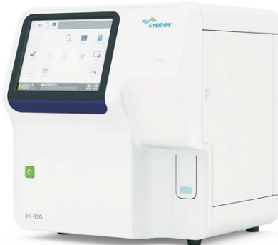
Sysmex XN 350 Automated Hematology Analyzer