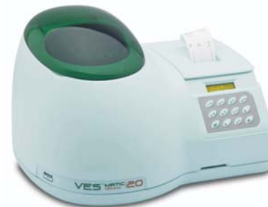
VESMATIC 20 Automated ESR Analyzer