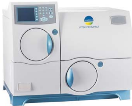
VITEK 2 Compact Automated ID/AST Instrument

AFB Stain, Pus AFB Stain, Sputum Albert Stain, Throat Swab C & S, Stool C & S, Pus C & S, Aspirate C & S, Body Fluids C & S, Blood-Rapid, Blood C & S, Conjunctival Swab C & S, Throat Swab C & S, Urine Fungus KOH Prep., Nails etc Fungus KOH Prep., Skin etc Meth. Blue Stain for Fungus, Fluid / Aspirate etc. Gram Stain, Pus Gram Stain, Sputum Mycobacterium C&S, Pus Mycobacterium C&S, Sputum