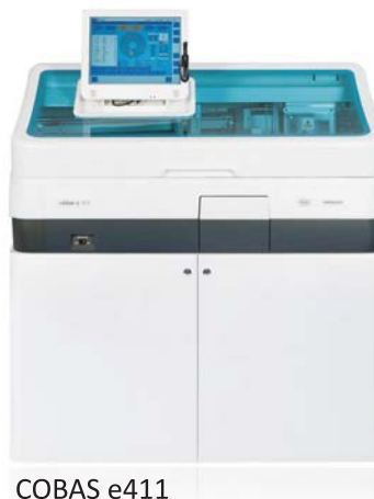
COBAS e411 Immunoassay System